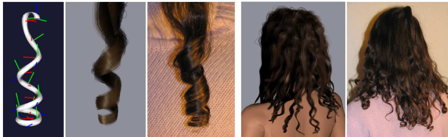
Figure 1: Virtual versus real hair ringlets